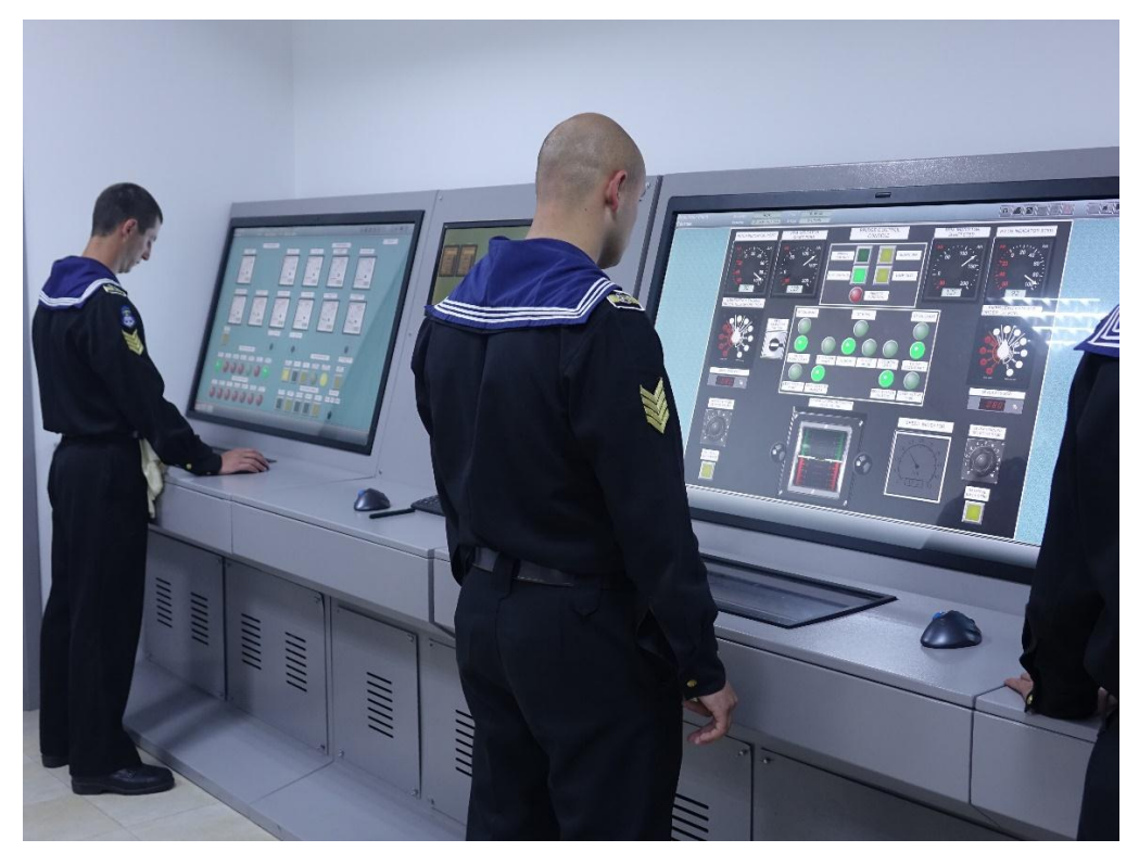
Figure. 1 Reacting to a situation – a fire in a machine room (using a smoke generator)

The simulator has the ability to configure different exercises according to requirements, including simulation and integration of real physical for marks – use of a smoke generator. The simulation training system offers a variety of solutions to provide focused sessions and recurring tasks with a variety of scenarios and accidents in a short period of time. The simulator also allows the crew to interact. The aim of the exercise is to achieve confidence and skills by the crew in the engine room as well as professional orientation in the used equipment and systems. An example of this type of training of fire engineers is given in the figure 1.